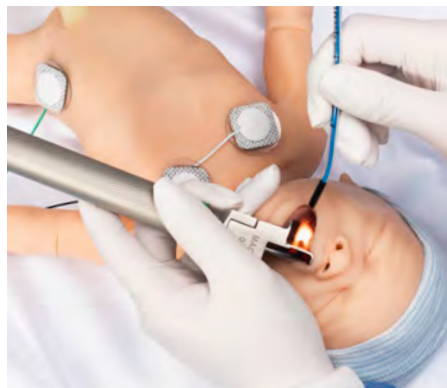
Anatomically accurate oral cavity and airway