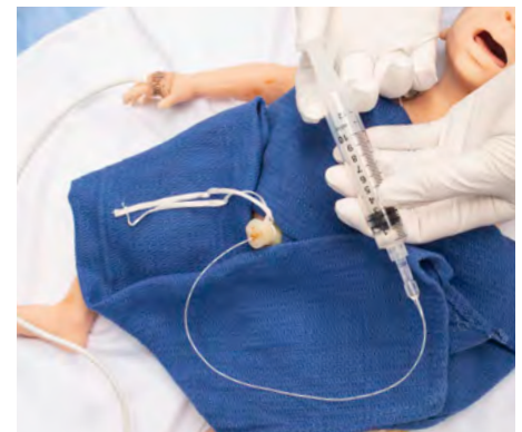
IV access on dorsum of hands, dorsum of left foot, and umbilicus