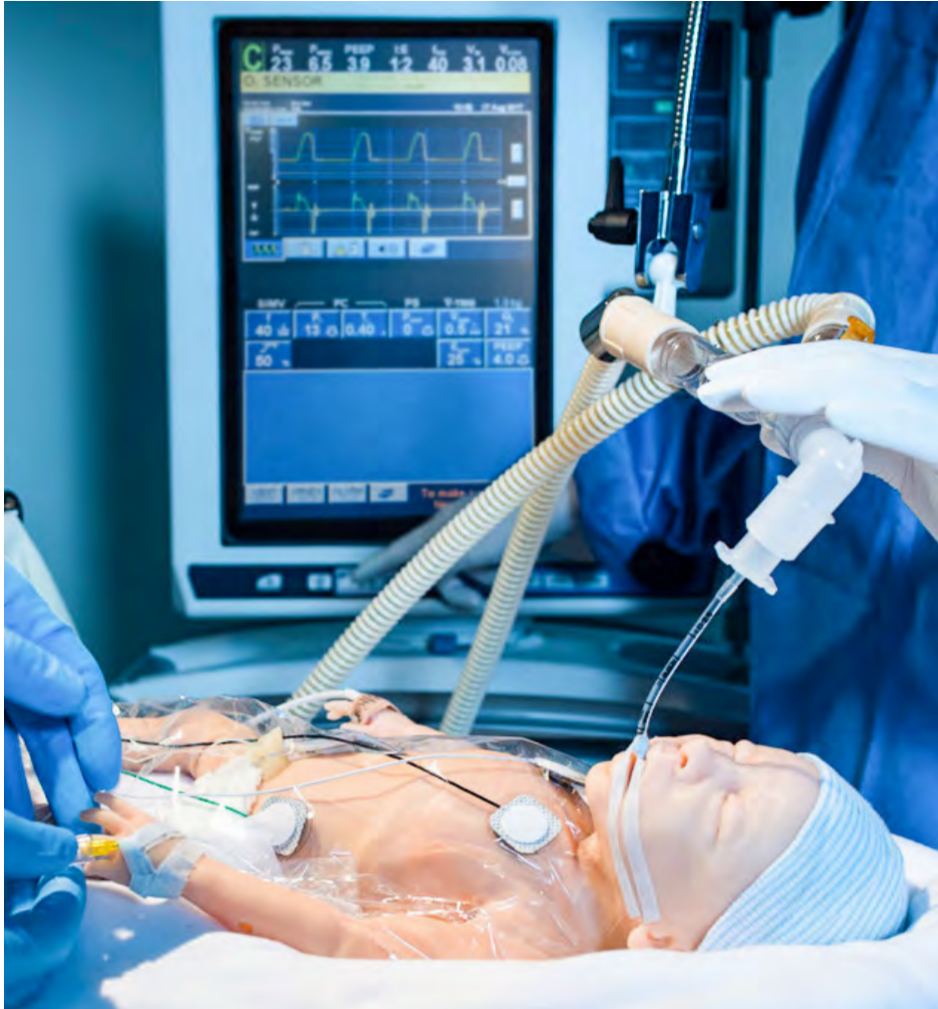
Premie HAL connected to a mechanical ventilator using a standard patient circuit.

Premie HAL® features compliant lungs that produce realistic PV waveforms on real mechanical ventilators and other respiratory equipment. This allows participants to follow guideline-recommended settings and algorithms while developing skills more directly transferable to real situations.